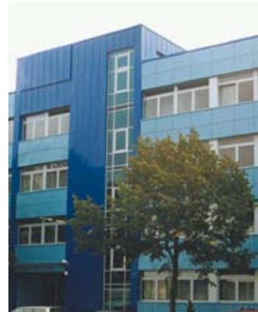
TRADE SCHOOL IN KREUZBERG, BERLIN