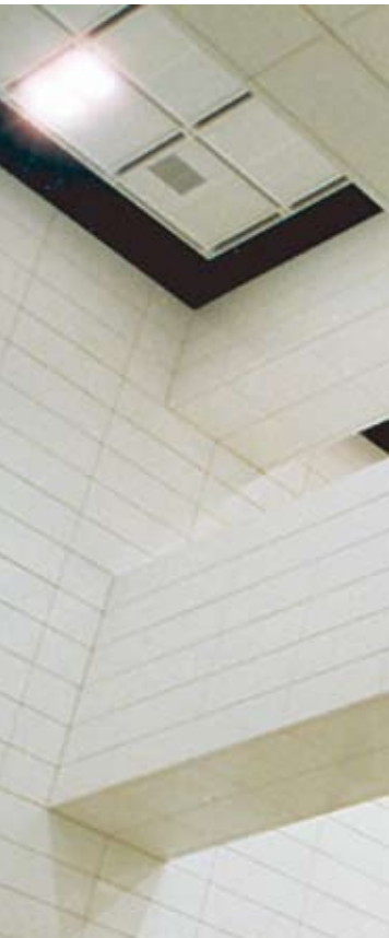
TSING YI STATION, HONG KONG